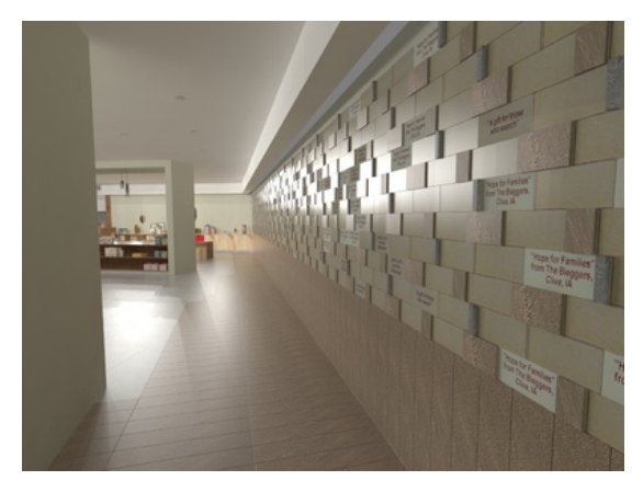
The wall of engravings from the Discovery Center Inscription Appeal.

Entering a new phase of development, the Discovery Centre is expected to significantly enhance the Village economically by attracting more visitors and tourism opportunities.